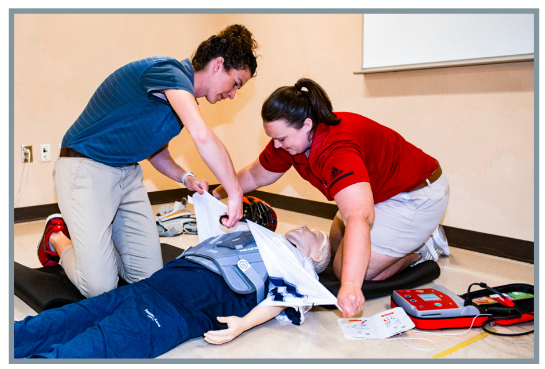
Athletic Trainers from The University of Lynchburg. The Effect of Lacrosse Protective Equipment on Cardiopulmonary Resuscitation and Automated External Defibrillator Shock

US Lacrosse and the US Center for SafeSport are invested in using a centralized database that ensures the safety of children while avoiding harm to individuals affected by the database. In addition, a new or updated centralized database is about to go live on the US Center for SafeSport's website. The research team includes experts on sex offender registration and notification practice evaluation and will provide US Lacrosse and the US Center for SafeSport with detail on who is using the database, how it is being used, and best practices moving forward. In addition, via data obtained from users of the centralized database, the current study will inform internal policies and practices.